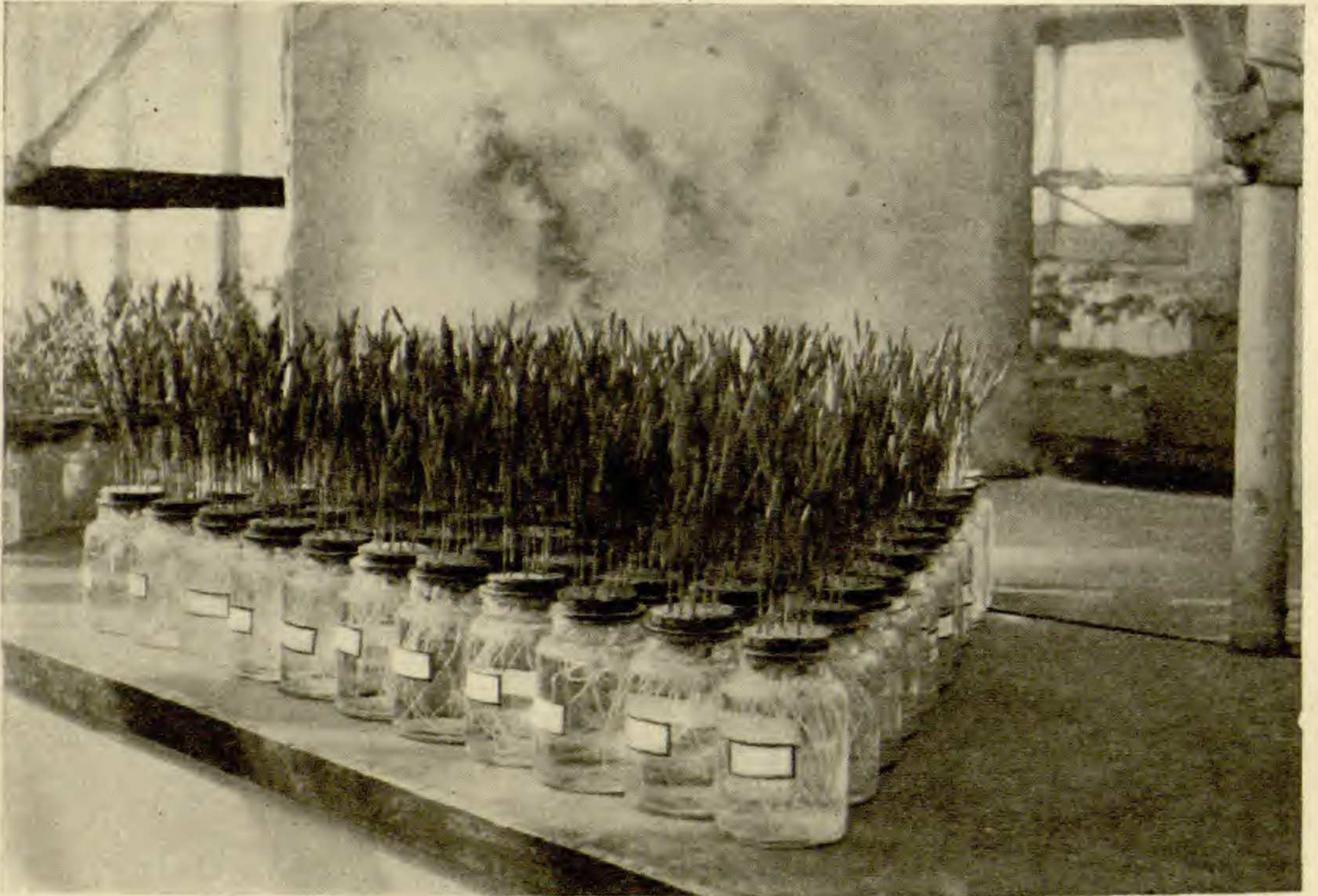
FIG. 1.—Wheat plants growing in nutrient solutions